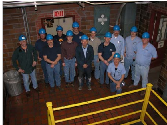
Power Plant Go -To Team members trained in incident investigation.