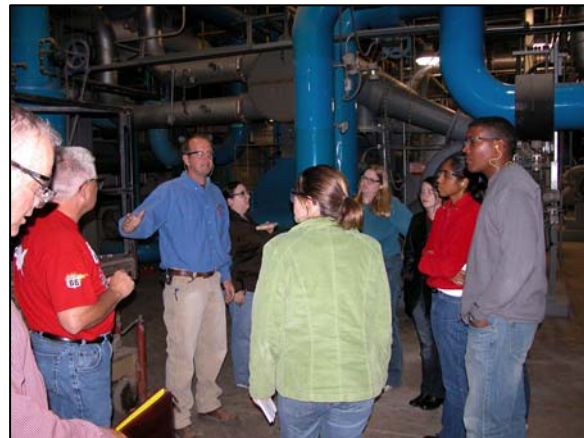
Safety presentation on shop floor.

In 2004, Facilities Management launched a strategic and comprehensive safety initiative, Systems of Safety. In 2005, Facilities Management continued to work to build awareness and identify compliance issues, note program deficiencies, and put new processes in place for safety. A safety engineer was the