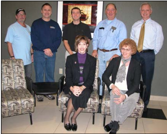
Route 66 planning committee

communication. The categories and point system were chosen to ensure staff members were rewarded for what they were doing right. The scorecard was kept up-to-date by designated persons in each unit.