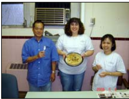
A unit arriving at the mid-point gets ready to receive their award for safe practices.

Communication before the launch is essential. Everyone in the organization needs to understand the goals and benefits. Moreover, communication needs to continue