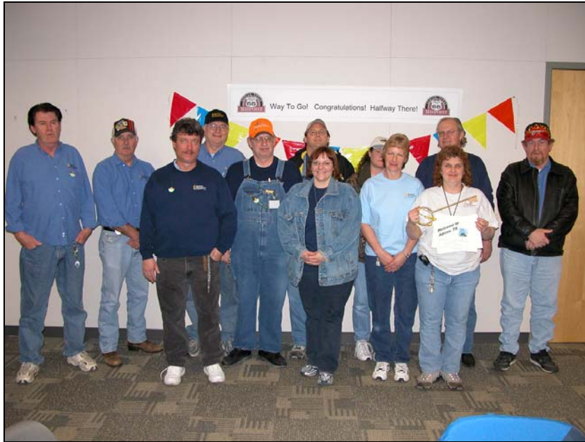
The first Facilities Management group to reach the mid-point, Mid-Point Café, on Route 66.

The concept of Route 66 was channeled through the management level of the organization to gain approval and support, and to aid in the communication process.