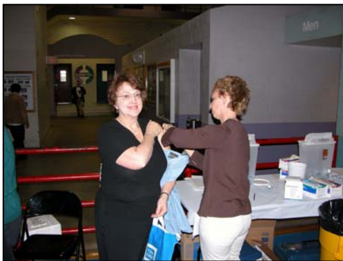
Facilities Management staff member receives her flu shot for an extra point at the UI Health Fair.

Scorecards tracked twelve safety training requirements for each group (see appendix A). Point values were calculated by relative importance to the safety program; therefore, some items were assigned more points. Recognizing a link between wellness and safety, points were also given to recognize employees who attended the UI Health