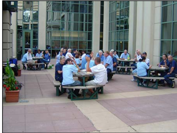
A custodial group celebrates their arrival at the Mid-Point Café with pie on the terrace.